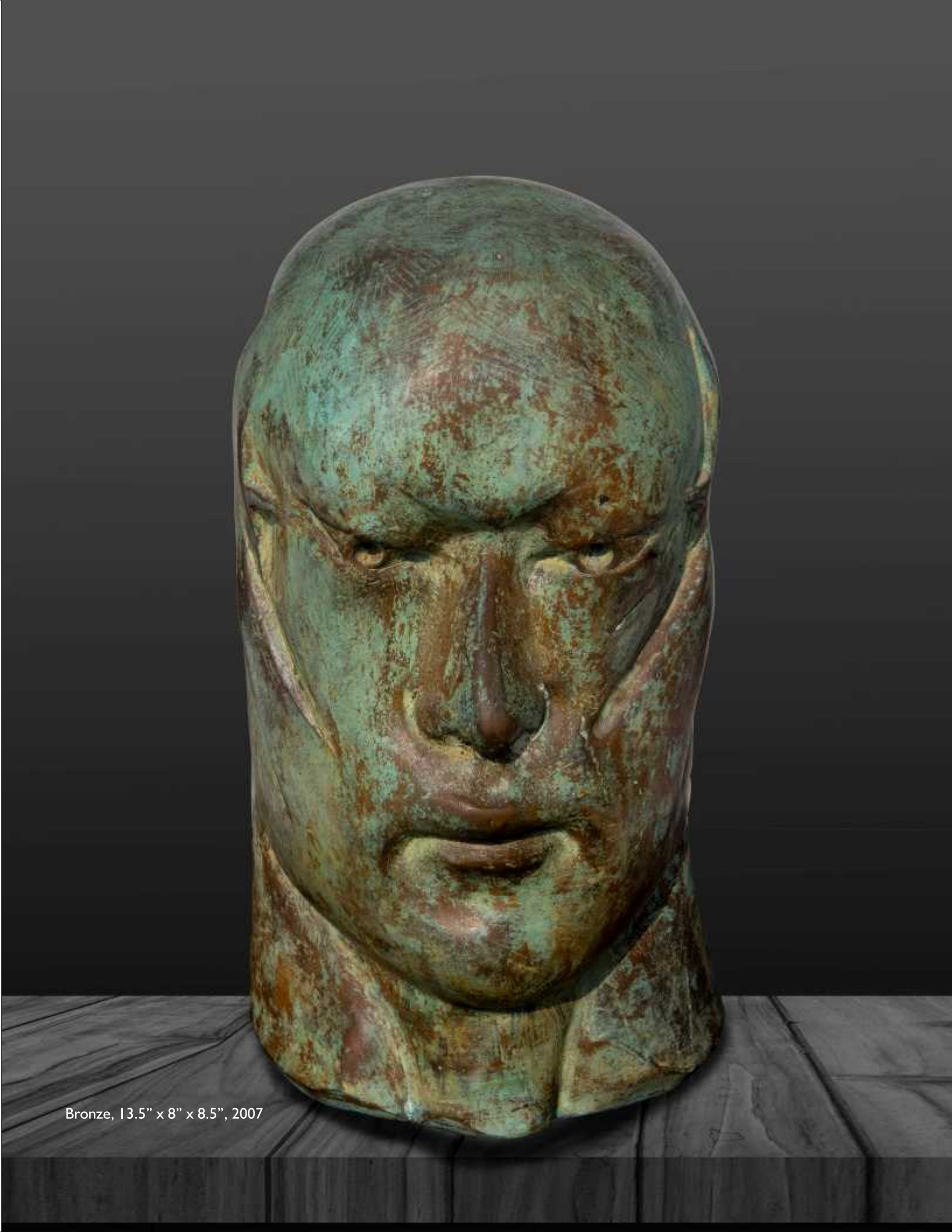
Bronze, 13.5" x 8" x 8.5", 2007