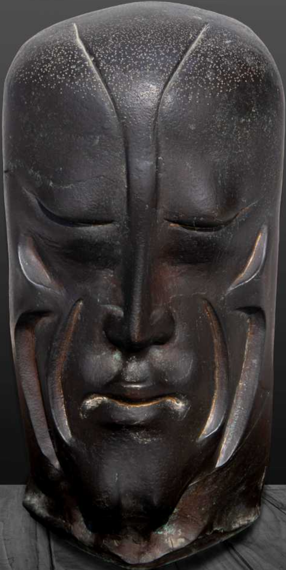
Bronze, 12" x 6" x 7", 2007