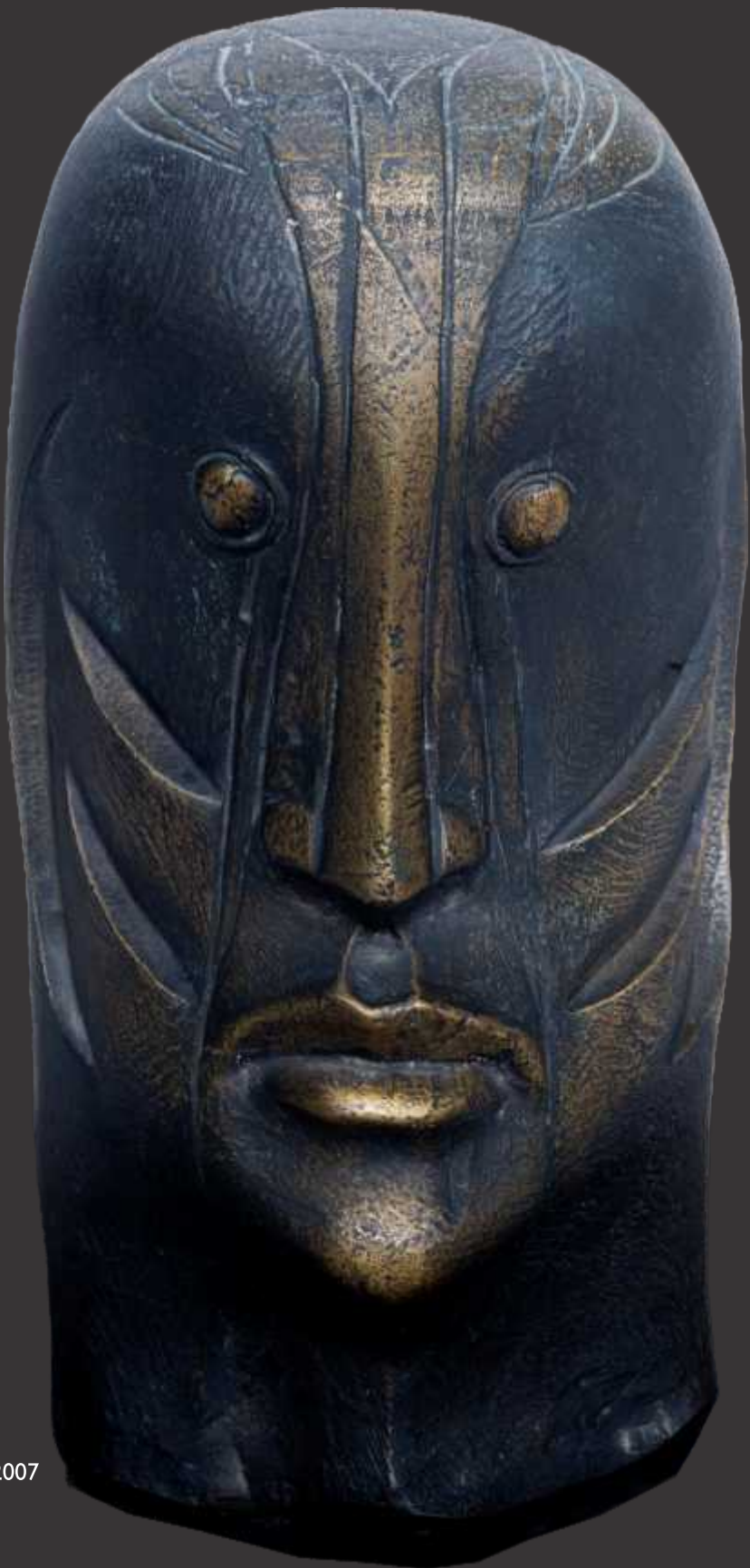
Bronze, 13” x 6.5” x 8”, 2007