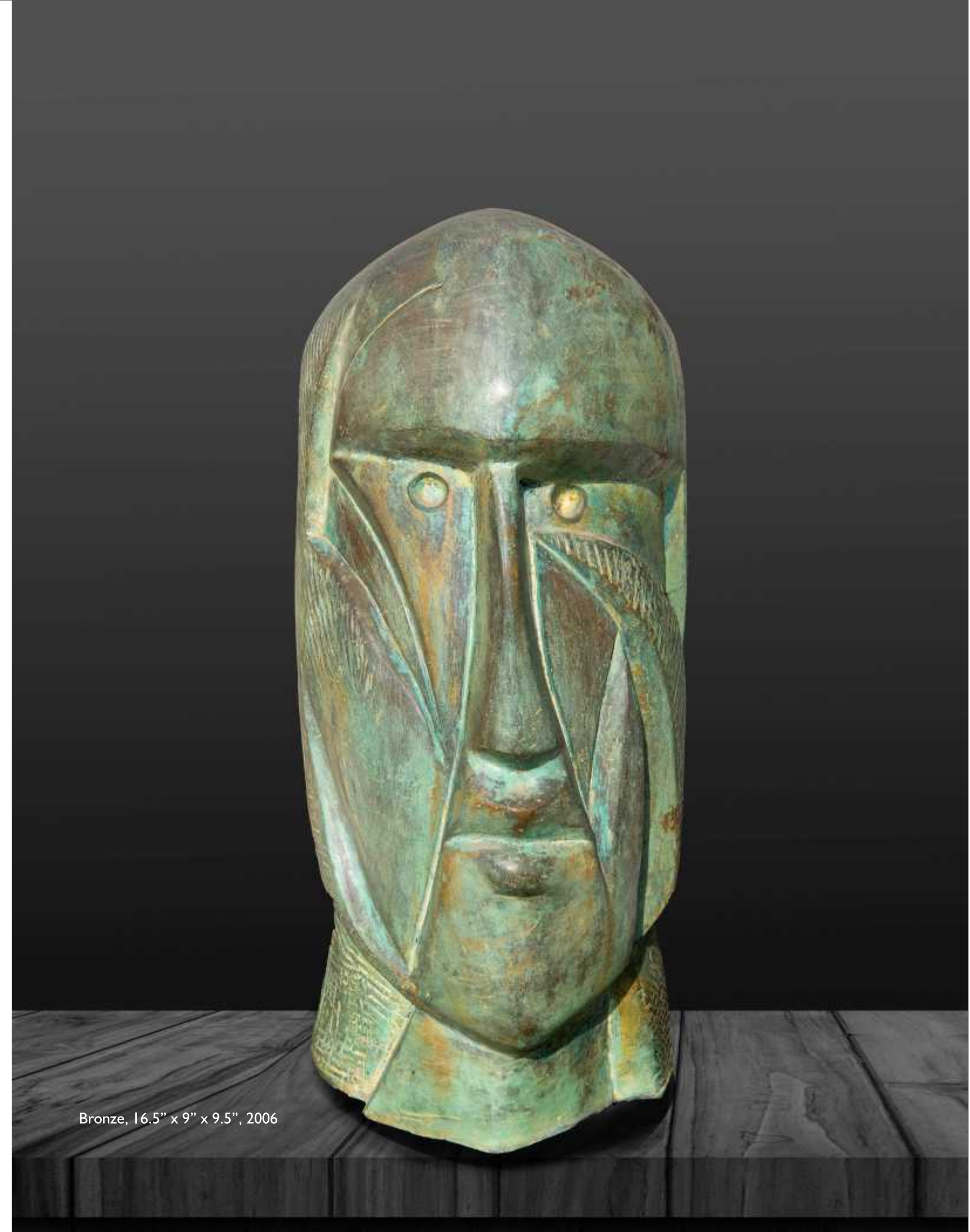
Bronze, 16.5" x 9" x 9.5", 2006