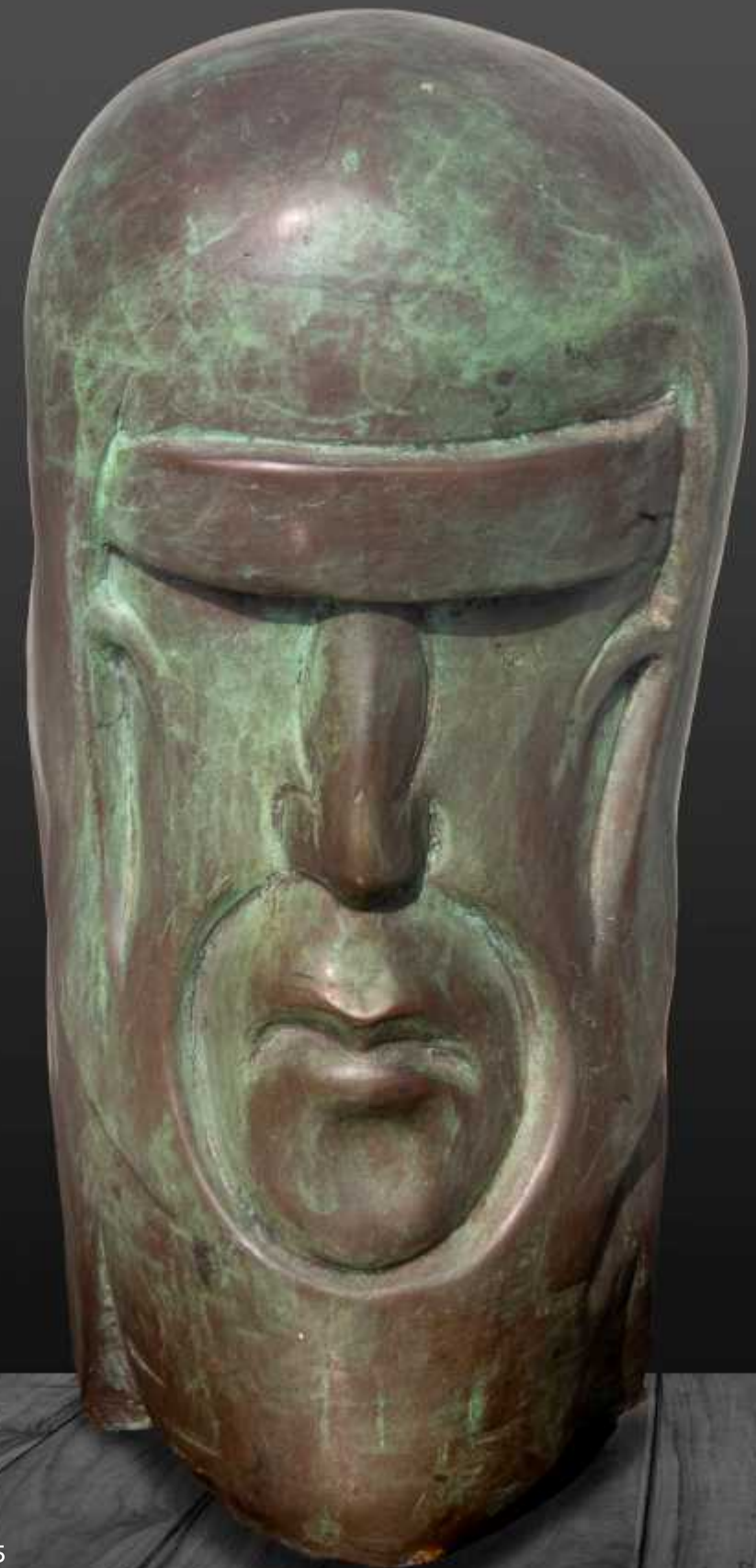
Bronze, 14" x 7.5" x 8", 2005